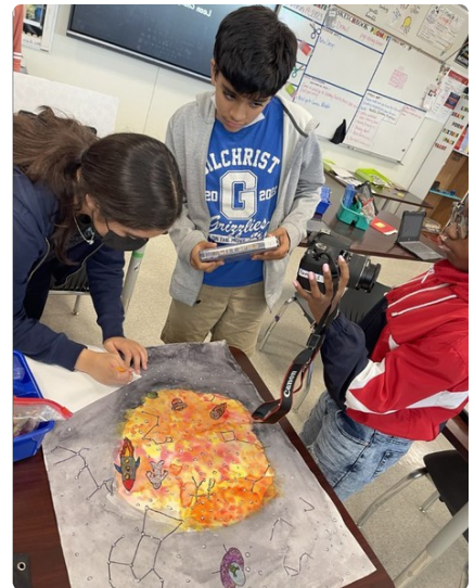
Digital Photography Class