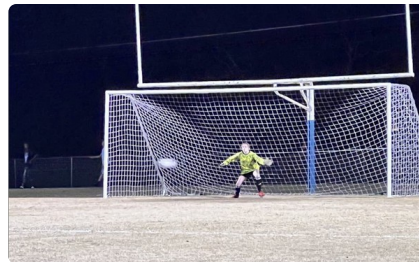
Girls Soccer Vs. Griffin