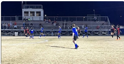
Girls Soccer Vs. Griffin