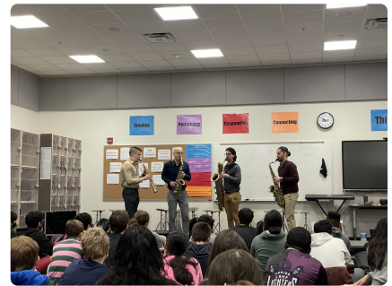
The Sinta Saxophone Quartet performing for our band students.