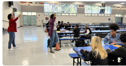
SAIL High School visiting with our 8th graders